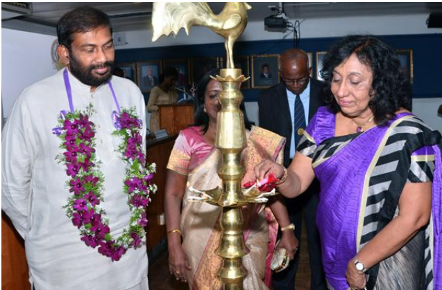
Inco launching 2016