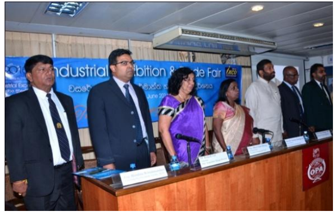
Inco launching 2016