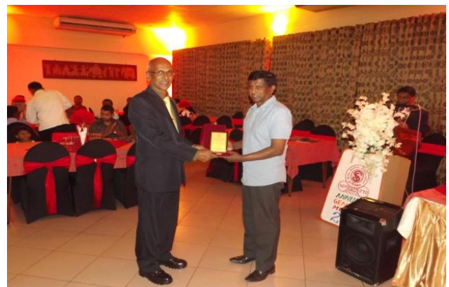
SEDO AGM & Get-together