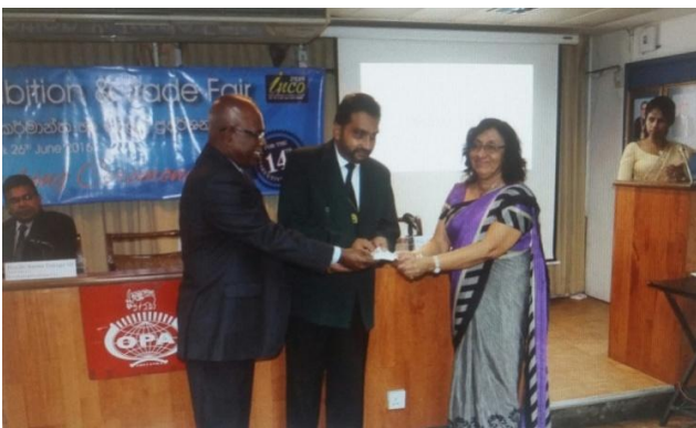
SEDO AGM & Get-together