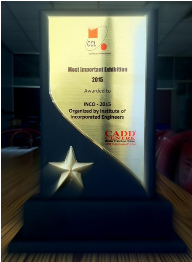
Award received by inco for 2015 exhibition