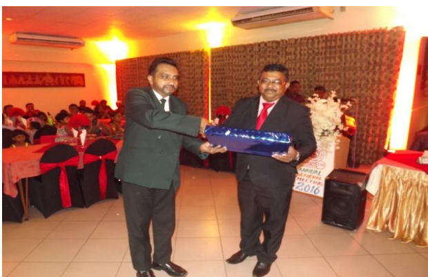
SEDO AGM & Get-together