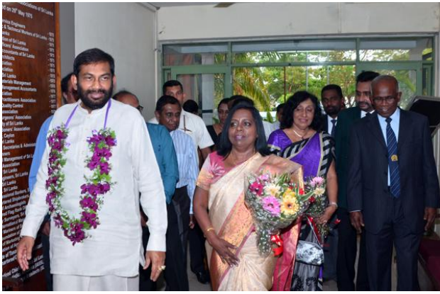
Inco launching 2016