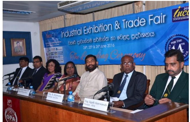
Inco launching 2016