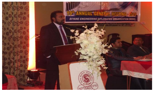
SEDO AGM & Get-together